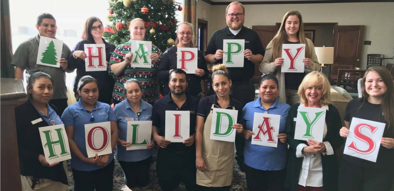
The Staybridge Suites—Carmel team got in the holiday spirit