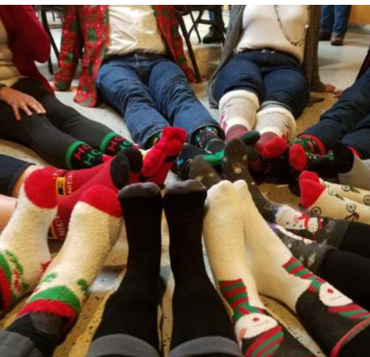
The AHM team participated in a holiday sock exchange