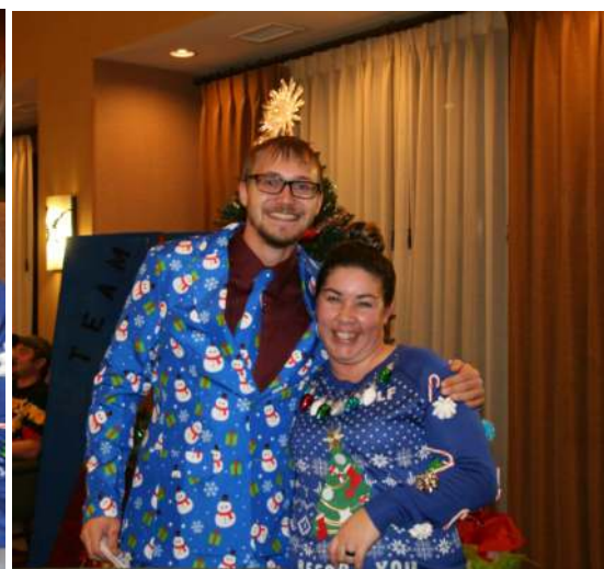
A few photos from the Hampton Inn and Suites—Riverton team celebrating the holidays at their annual Christmas party