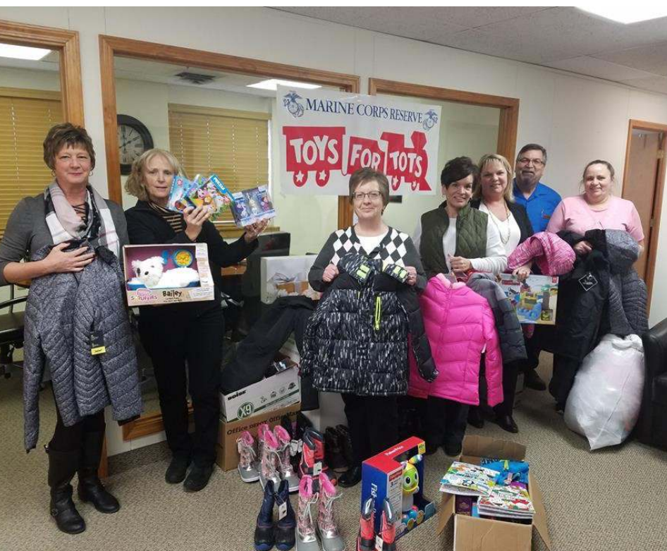
Members from the AHM team stop to take a picture as they load donation items up for Toys for Tots/Coats for Kids

American Hospitality Management helps those in need during the holiday season