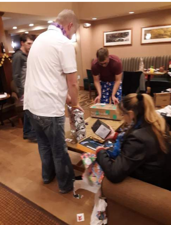
Members of the Hampton Inn & Suites—Riverton team opening gifts at their Christmas party.