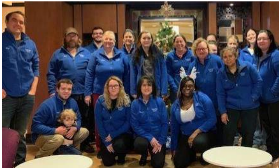
The Fairfield Inn and Suites—New Buffalo team posing at their holiday party.