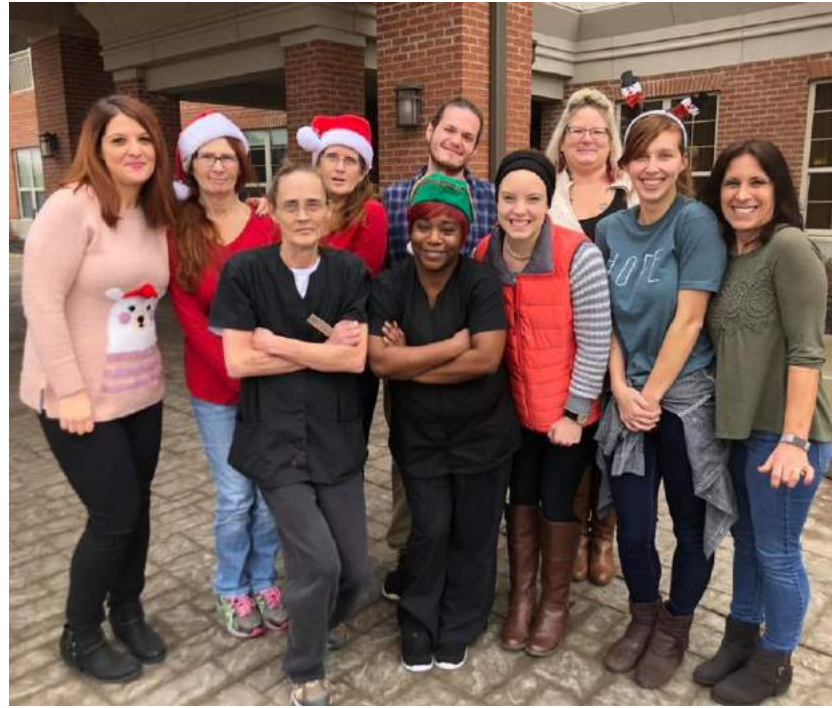
The Courtyard by Marriott—New Albany team taking a break from their Christmas party festivities to pose for a picture.