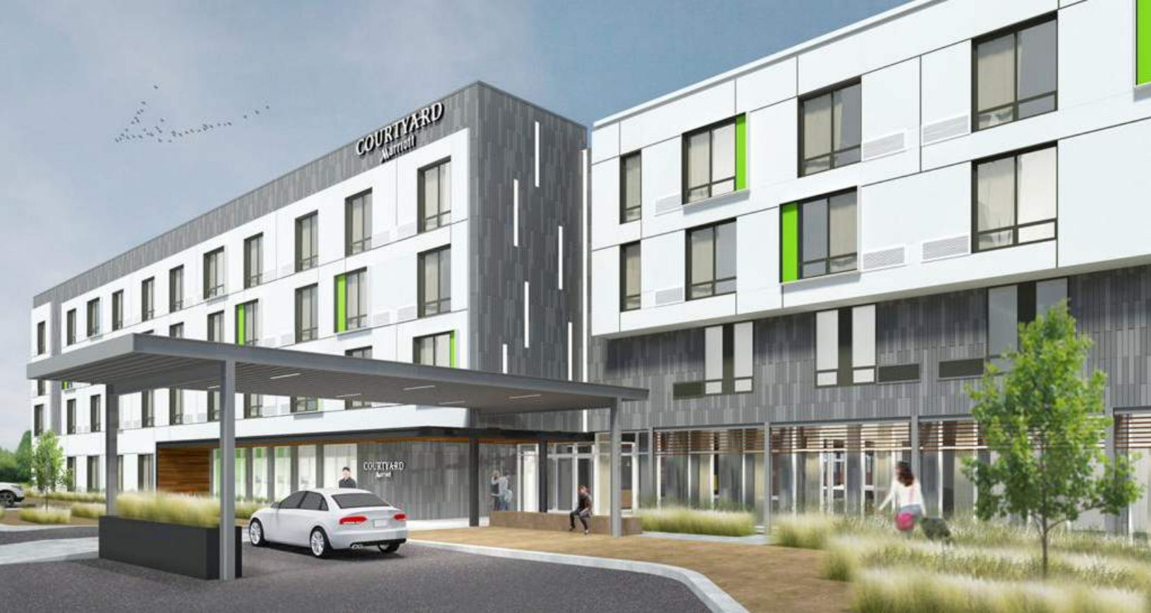
Above is a prototype photo of the Courtyard by Marriott in Mason, Ohio