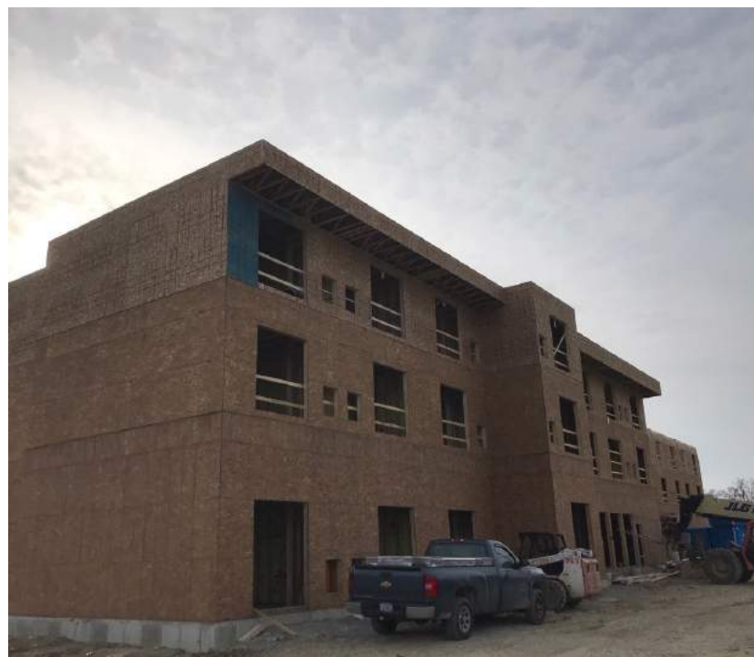
Construction progress photo of the Courtyard by Marriott—Mason