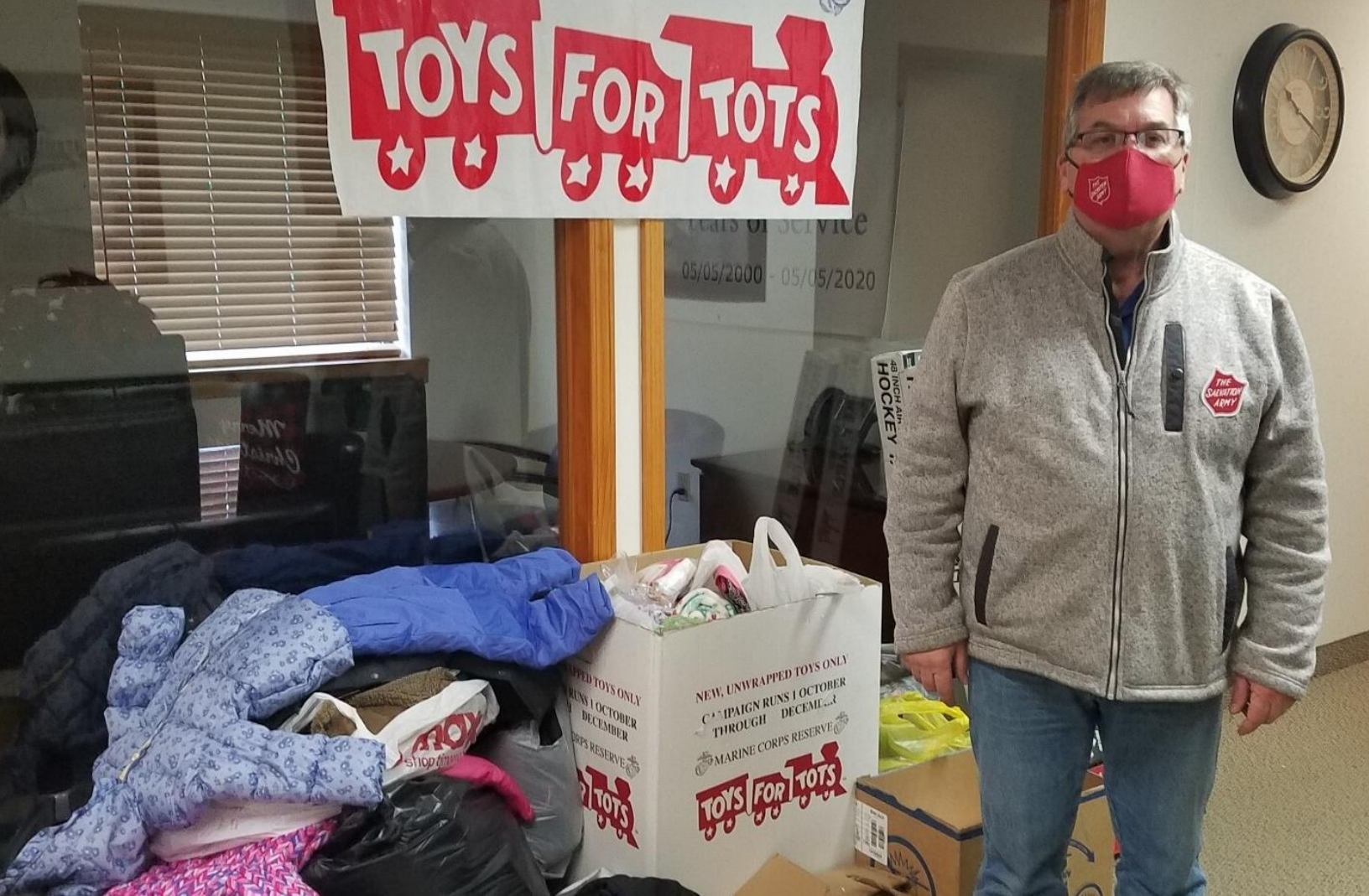
Roman from the Salvation Army picking up our Toys for Tots donation