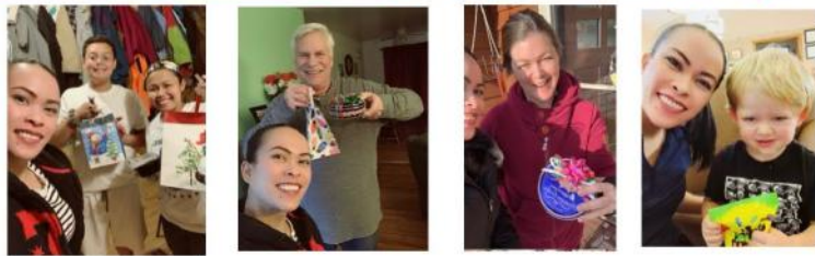
Giving away 27 gifts for individuals, 20 cookie tins and 15 bags of sweets around the town.