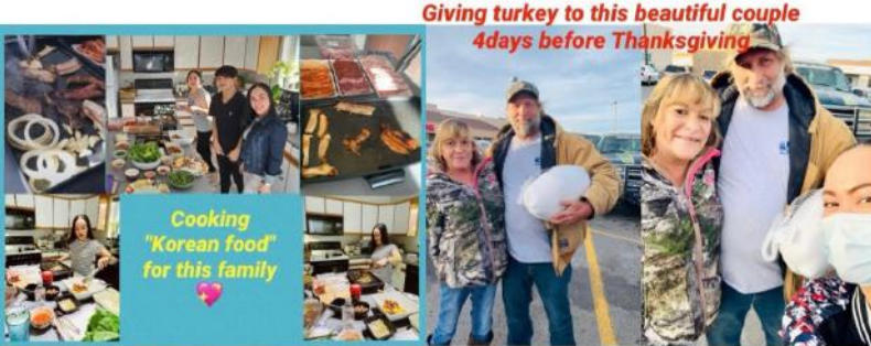
Giving turkey to this beautiful couple 4days before Thanksgiving